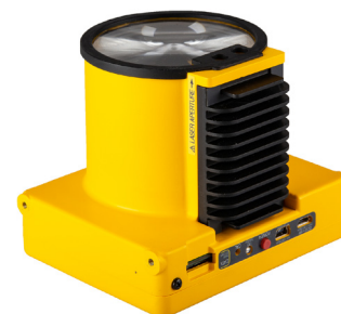
Laser Falcon optical unit